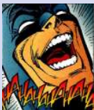
41 KB JPG

Flutterfaggot 12/05/13(Thu)23:00 No. 14925583