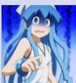
158 KB JPG